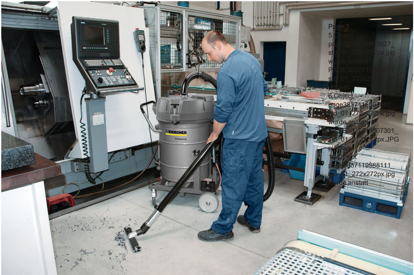
IVR-L 100/24-2 Tc Dp