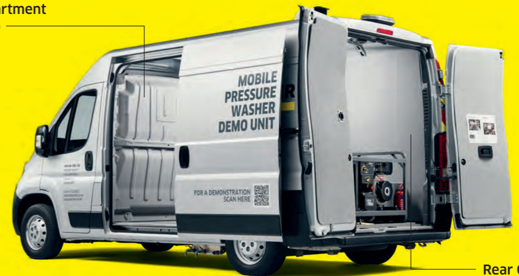
Front Compartment (Dry Section)