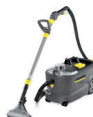
Spray Extraction Cleaner