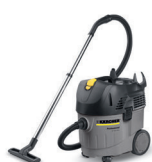
Wet & Dry Vacuum Cleaner