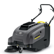
Walk-Behind Vacuum Sweeper