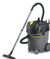
Wet & Dry Vacuum Cleaner