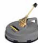
FR 30 Hard surface cleaner