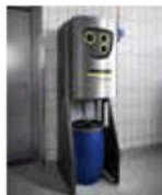
Base frame stainless steel 2.210-059