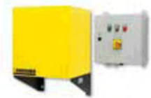
Boiler HWE 860 3.070-036