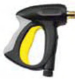
Easy Press trigger gun 4.775-463