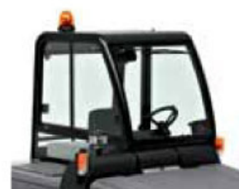
Comfort cabin 2.851-264.7 Comfort cabin with heating 2.851-265.7 Comfort cabin with A/C 2.851-266.7