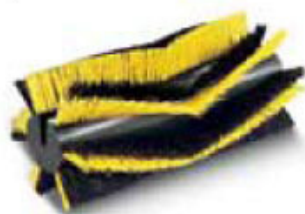
Main brush Soft mixed bristles Soft bristles Hard mixed bristles