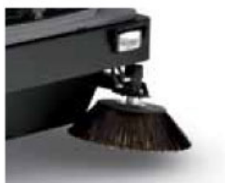
Left side brush 2.851-274.7