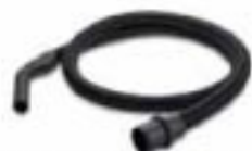
Suction hose with bend (2.5 m) 4.440-626.0