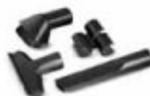
Nozzle set (ID 35) 2.880-143.0