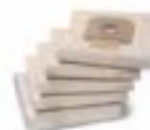
Paper filter bag 6.904-285.0