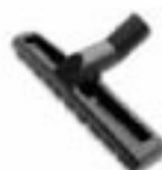
All-purpose floor tool (300mm) 6.906-512.0